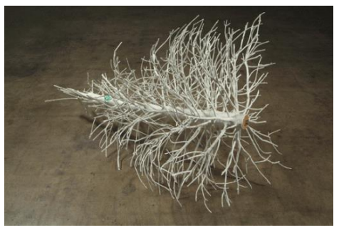
Treaty, 2007. Tree, 2-part epoxy metal, 65 x 40 x 36.5"