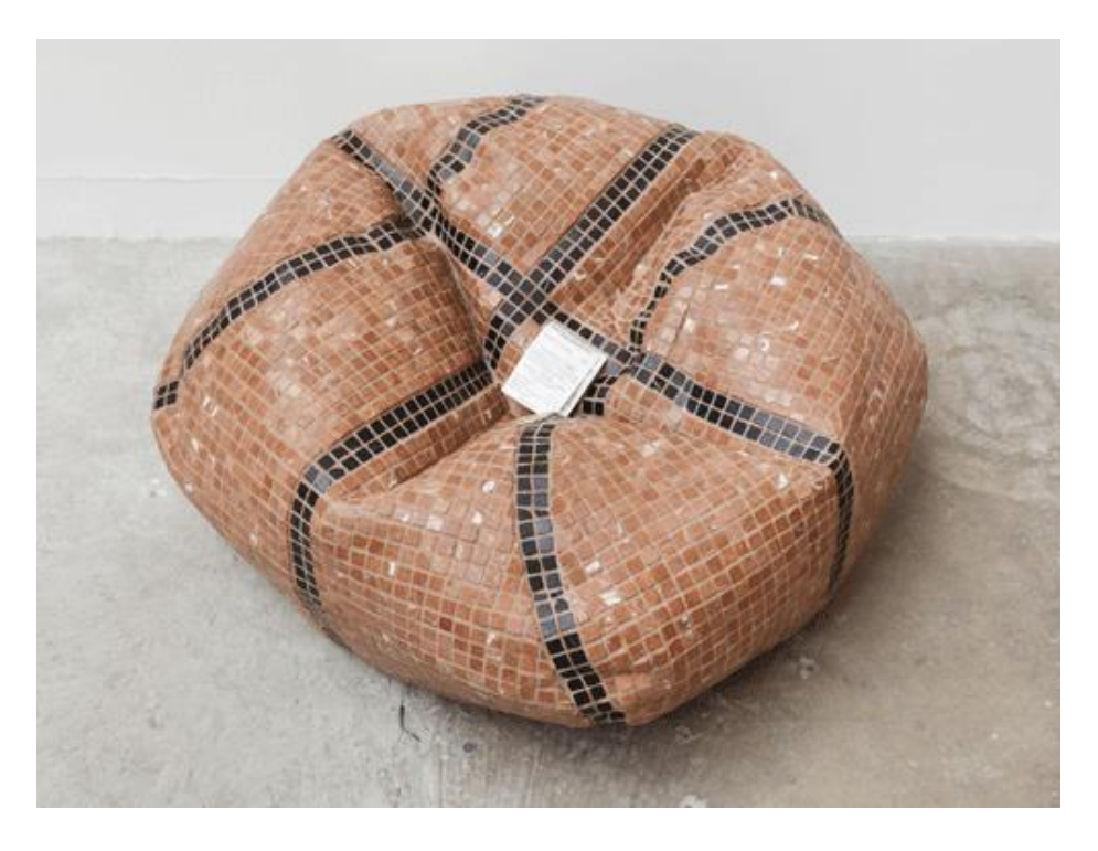
The Rock, 2014. Basketball beanbag chair, fiberglass, AQUA resin, marble tile, grout. 16.25 x 35 x 34.5 inches

The objects I use in my sculptures are not particularly outrageous. I will take a recognizable and meaningful object, like an old mattress or set of trophies, and turn it into an artwork through some type of bedazzlement or alteration. After someone views one of my sculptures they can see the spirit of the work in the next trophy or abandoned mattress they encounter. An unaltered object can share a sense of exaltation as it reminds the viewer of one of my sculptures.