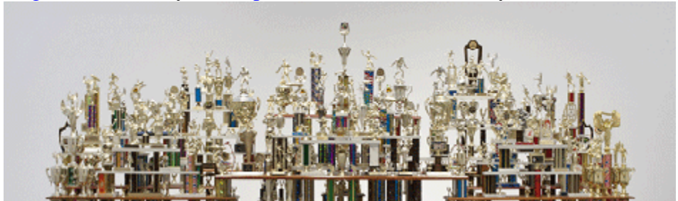
Second to None, 2011. Trophies, trophy parts, wood. 94.5 x 146 x 39 inches

August 13, 2014 By intsculpturectr in In the Studio By Jan Garden Castro Leave a comment