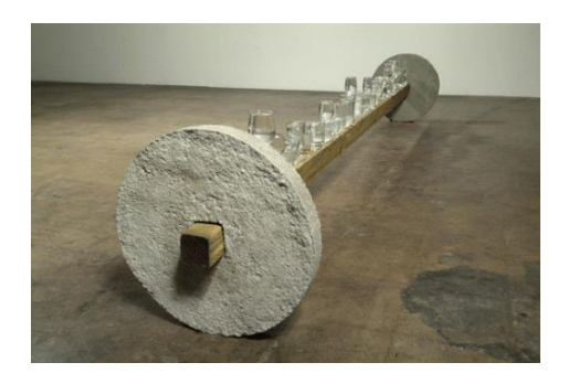
Rollin' On 23's 2007. Glasses, pressure treated lumber, concrete, water, stones 144 x 23 x 23"